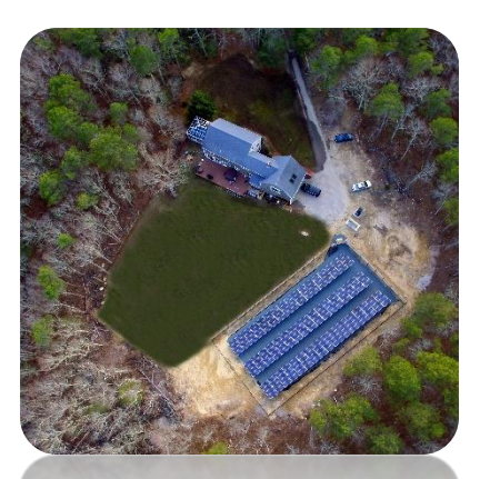
Our designs include advanced GIS capabilities, fully integrated stormwater hydraulics, PV panel array layout, site screening and earthwork balancing, which allows us to evaluate alternative designs in the conceptual planning stages of a project.